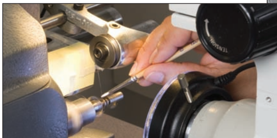
Precision winding techniques performed with the aid of a microscope.